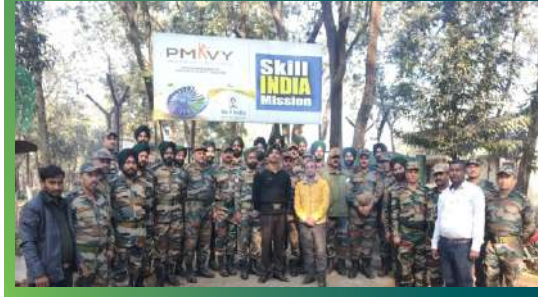
Glimpse of Micro Irrigation Technician Batch at Punjab Regiment, Ramgarh

Under the "SANKALP" scheme, ASCI in collaboration with NSDC conducted the Training and assessments of Army Veterans in 03 job roles – Micro-Irrigation Technician, Dairy Farmer & Organic Grower. The programme was undertaken in 2 locations, namely, Punjab Regiment Center in Ramgarh & Raiwala Cantonment Board, Dehradun.